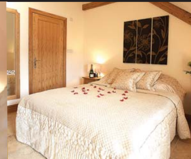
Luxury bed and breakfast or self catering accommodation.