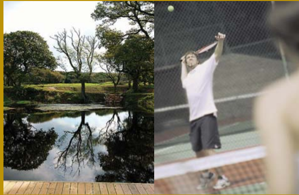
design | bluesky-media.net