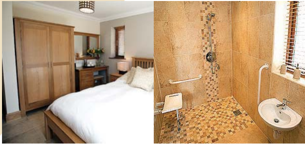
Disabled friendly bedroom with en suite wet-room and private parking alongside.

Your room is the perfect base from which to make the most of our private grounds. Play tennis, take a woodland walk, go fishing in our private lakes, cycling or even horse riding - making the most of the on-site activities Oldwalls has to offer.