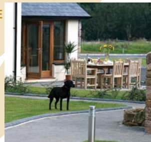
Each cottage has a safe, enclosed private garden for your dog.

At last, a luxury retreat that welcomes well behaved pets with purpose designed dog-friendly suites. Walk your canine companion freely and leadless around our large private grounds with nearby access to un-spoilt dog friendly beaches.